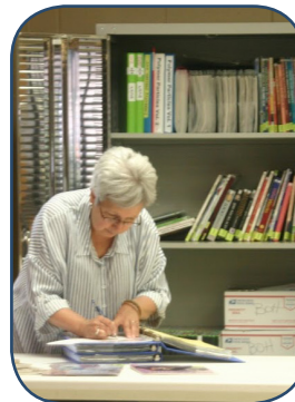
June Meeting Pics